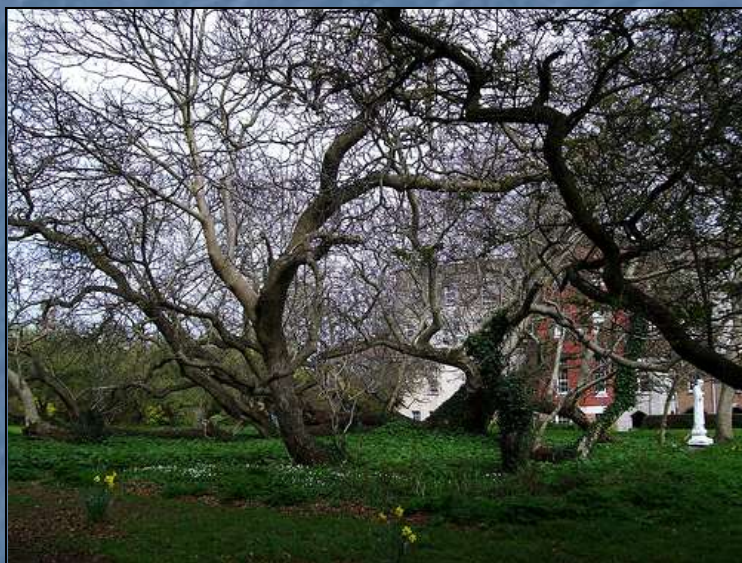
St. Maelruain's Tree